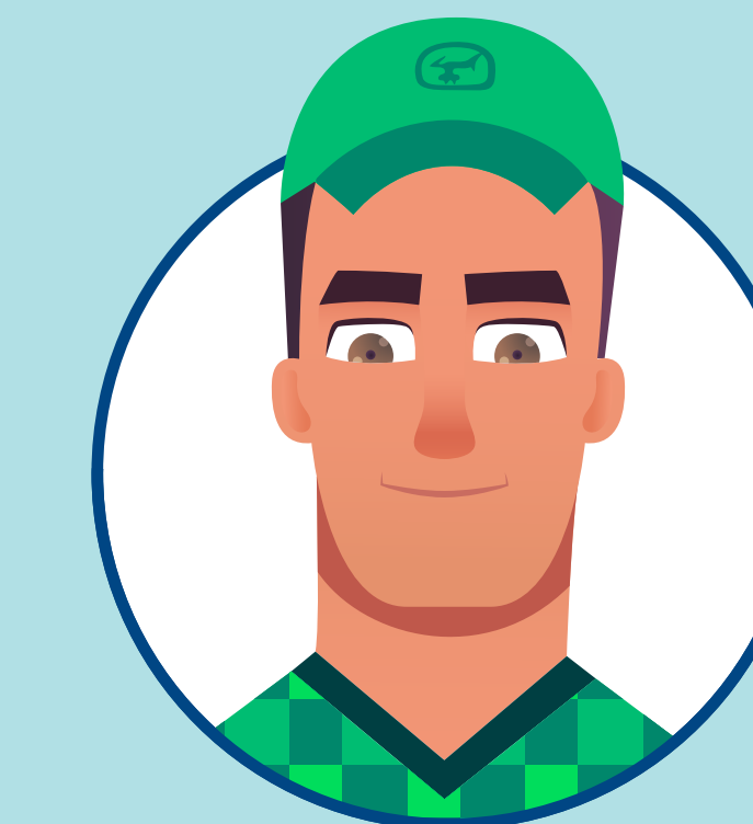
Patrick the Producer

Designer and Urban Resident A second-generation American who has developed an interest in high quality, locally-sourced food after recently losing weight. He is an avid technology user.