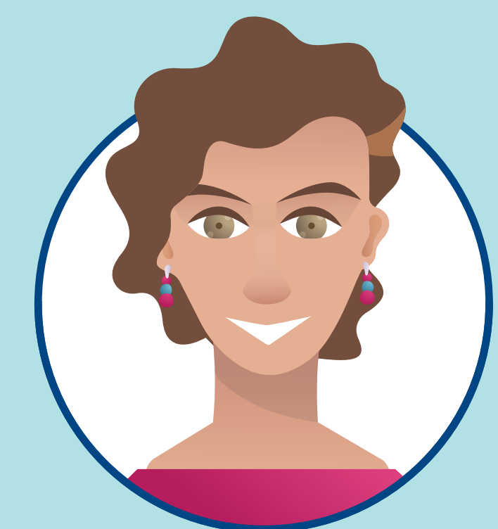
Lydia the Loving Parent

USDA serves over 900 unique customer types, from all walks of life with a diverse range of needs. The following people represent the top 10 customer types that USDA serves. Understand who they are and you can serve them better.