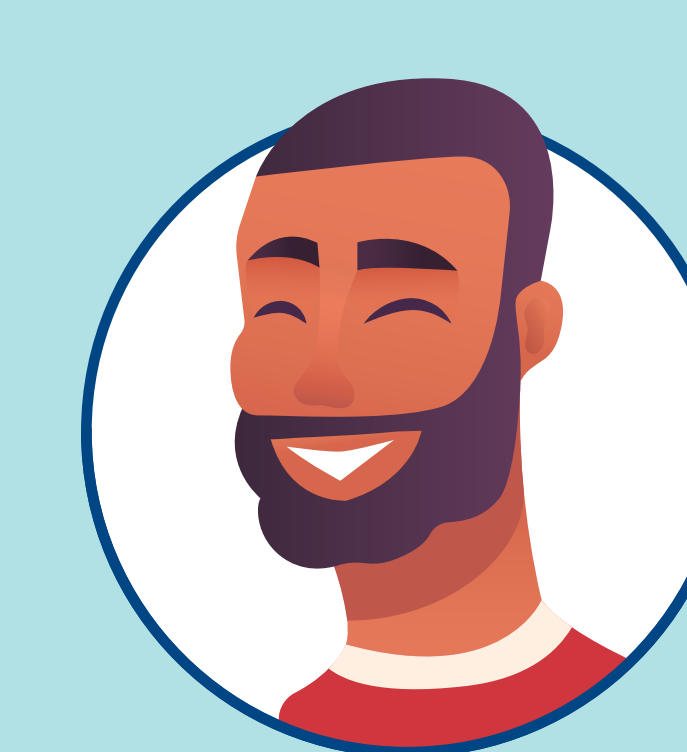
Preston the People's Advocate

Recreator and Adventurer A conservation-conscious college student who hikes in National Forests to escape the hustle of her demanding curriculum and experience nature. She shares her adventures online.